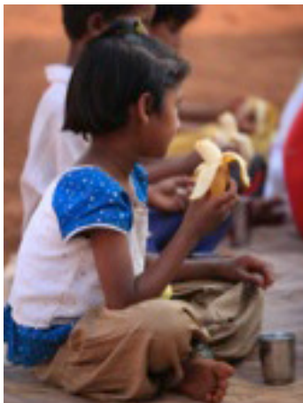
Snacks time at Avani

In recent times, the Avani staff have rescued the exploited children of these families and provided teaching at or near brickyard locations. With the help of Gandhi Society's donation, on January 1, 2011, Avani began operating five makeshift brickyard schools in the Kolhapur district, providing basic education and nutritious meals to 87 students (including 45 girls).