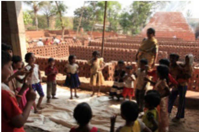
Avani School for children of brickyard workers

from the drought affected areas of Maharashtra come to Kolhapur to find work in the brickyards. The families live in very small, unhealthy dwellings without proper nourishment and clothing.