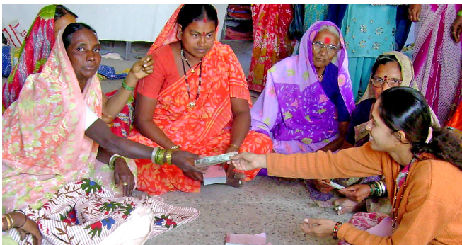
Microfinance in action at BNGVN