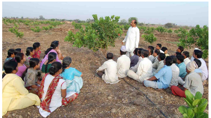
Providing Guidance to the Farmers

The partner has been very successful in the area of gender equality. In July 2007, there were only 10 girls in the class of 52, putting the percentage of female students at 19%. In July 2011, there were 27 girls in a class of 60. Thus the percentage of girls increased to 45%.