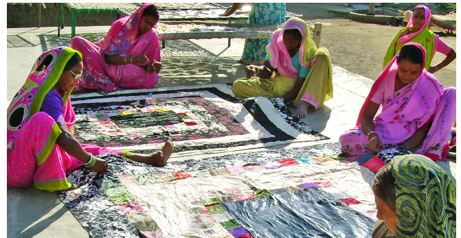
Group effort at BNGVN in making export quality quilts

be found within the community. One major area of focus for BNGVN has been the formation of Small Savings Groups. Poor people are trapped into the vicious circle of debt with sky high interest rates. Droughts and epidemics make the situation worse. To resolve these problems, ‘microfinance’ was offered. While the community was getting empowered through microfinance, it was also necessary to inculcate some discipline as well as values. This led BNGVN to introduce the concepts like “Gram Nidhi” (Village Fund) and “Aadarsh Gaon” (Model Village). The Village Fund is used to make loans to the needy on the recommendation of the village assembly, which verifies that the beneficiary fulfills the eligibility criteria. Social pressure motivates the family to abide by the terms set by the village assembly. The beneficiaries, though poor, are really diligent in paying back installments of the loan. So far, BNGVN has recovered 100% of all their loans.